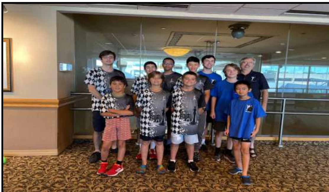
Members of the HCC present before round 4 of the 2023 Bradley Open Chess Championship

The Play More Chess Academy and the Hamden Chess Club seek to offer a wide range of opportunities for all ages to play and improve their skills at this most amazing game of chess!"