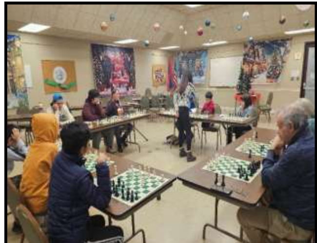
Players participate in the simul