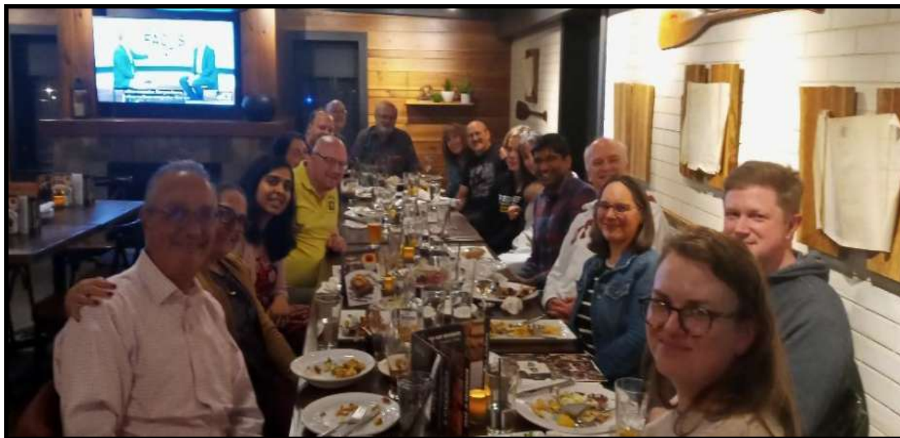
The NBCC volunteers and their family