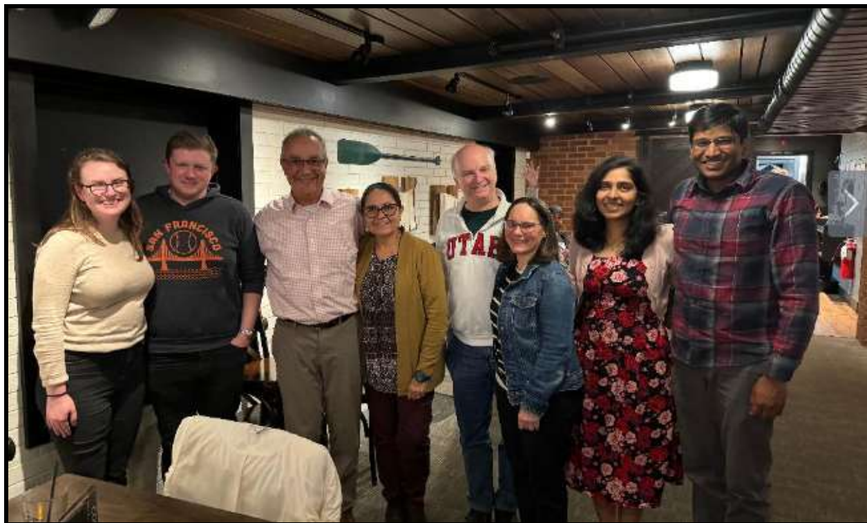
The NBCC officers and their spouses